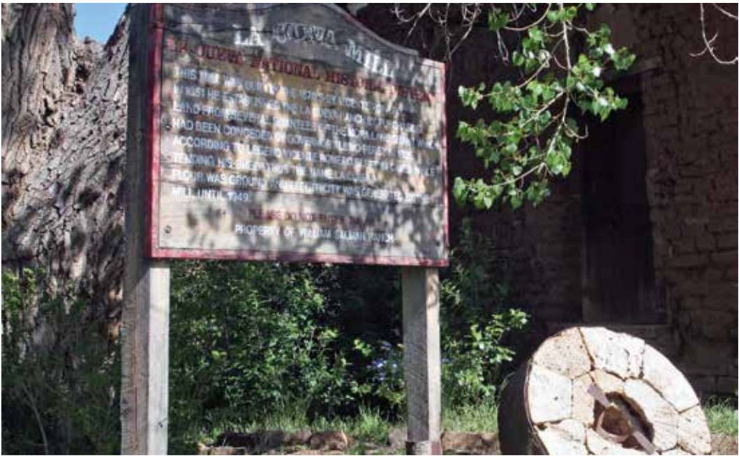
SIGN AT LA CUEVA MILL.