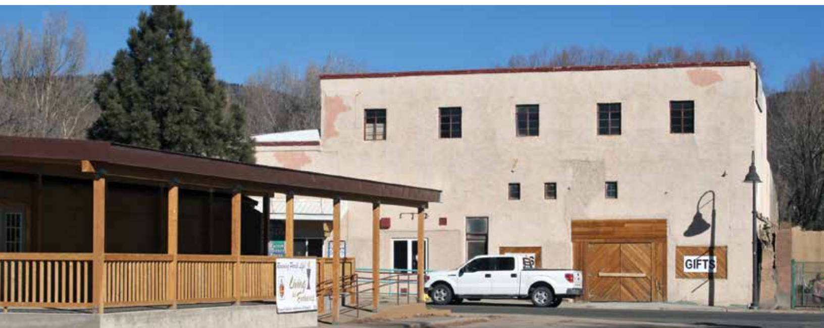
FACADE OF HISTORIC HANOSH HOTEL AND CHIEF THEATER (TWO STORY BUILDING ON RIGHT)