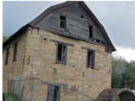
HISTORIC ST. VRAIN MILL AND WATER WHEEL, MORA

The boundaries of the Mora A&C Compound encompass a portion of the existing Mora Historic District (SR # 1524), listed on both the State Register of Cultural Properties and the National Register of Historic Places. The A&CC sits in the heart of the historic district and includes its most significant properties, such as the St. Vrain's Mill at the north, the St. Gertrude Church and associated properties at the south, and the Spinning Mill complex of buildings, including its historic theater and Butler House, at its center.