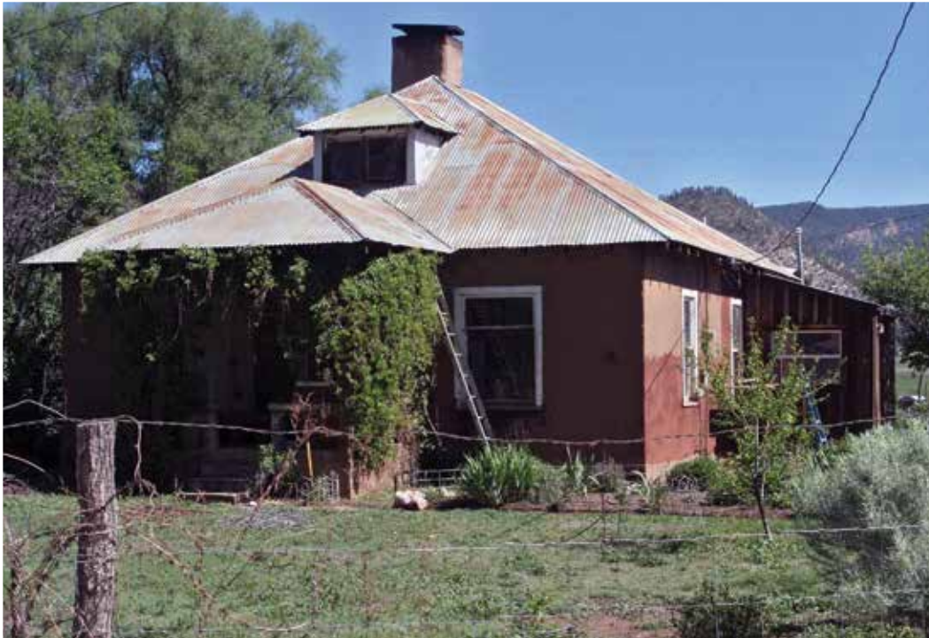
PRIVATE RESIDENCE, MORA VALLEY.