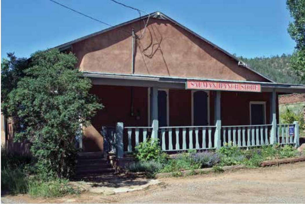
SALAMAN RANCH STORE AT LA CUEVA MILL.

Valley maintain subsistence-level relationships to agriculture, forestry, fishing and hunting.