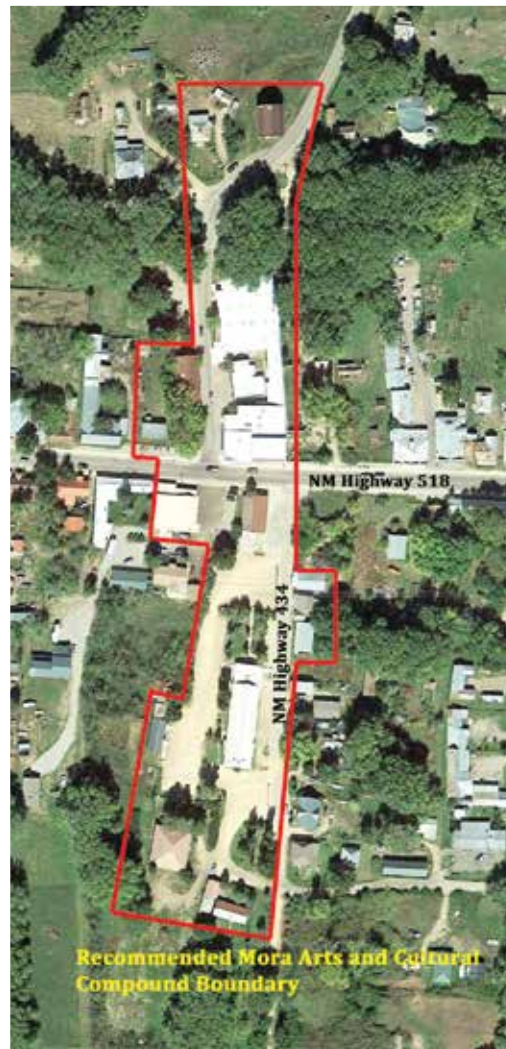
MAP COURTESY OF COMMUNITY BY DESIGN

The district is a compact and walkable area, generally a 1/4 mile radius, which creates a 5 minute "ped-shed," walking distance.