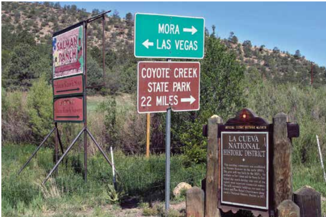
CLUSTER OF SIGNS ON HIGHWAY AT LA CUEVA, NM.