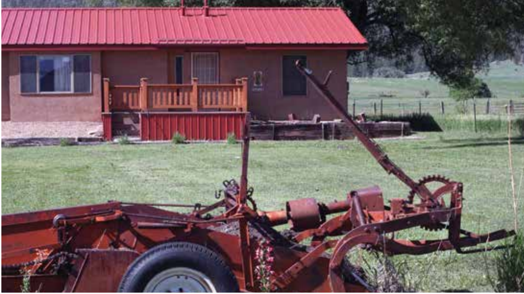
PRIVATE RESIDENCE, MORA VALLEY

Brief History of New Mexico's Arts & Cultural Districts