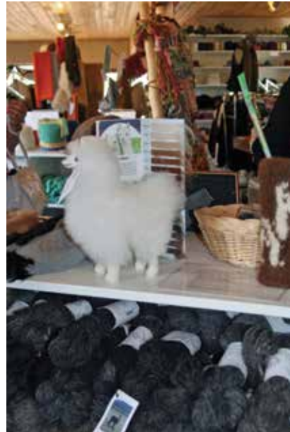
INTERIOR DISPLAY, VICTORY RANCH STORE, MORA.

Another asset is the location of the Mora A&CC within the beautiful Mora Valley, creating a place where residents, visitors and tourists can experience the history and culture of Mora and enjoying all that the area has to offer.