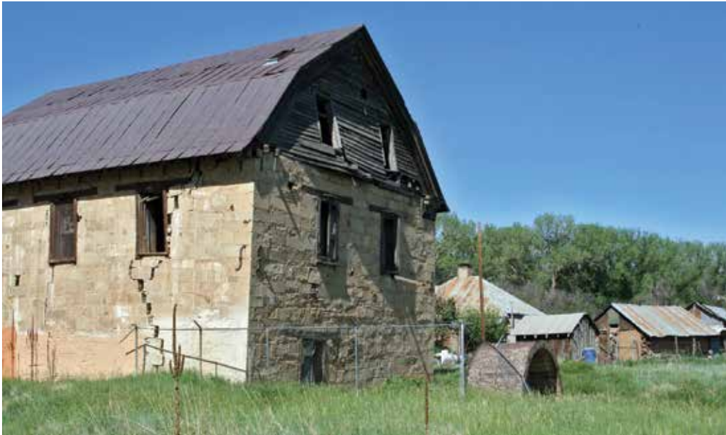
HISTORIC ST. VRAIN MILL, MORA

The New Mexico Arts and Cultural Districts Resource Team would like to thank: