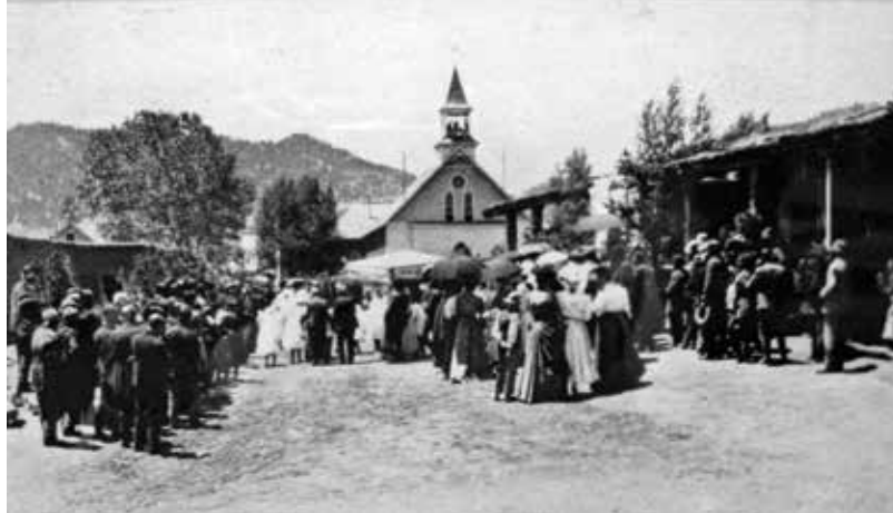
RELIGIOUS PROCESSION AT ST. GERTRUDE'S CHURCH, CA. 1900.

Physical Planning and Design is the art and science of assessing the socio-cultural, built and natural environment that in turn lays the foundation for creating a sense of place that is authentic and achieves the community's highest aspirations of