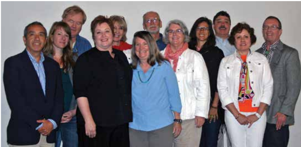
MORA ARTS & CULTURAL COMPOUND RESOURCE TEAM

While many of these recommendations are intended for consideration by the Mora A&C Compound Steering Committee within the two year start-up period, some strategies will have longer term relevance as the global creative economy evolves and Mora further diversifies its local economy and cultural opportunities.