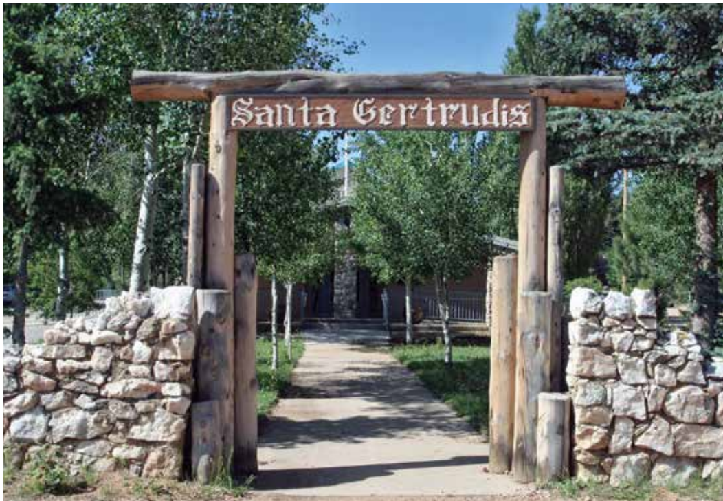
GATE TO GROUNDS OF ST. GERTRUDE'S CHURCH, MORA