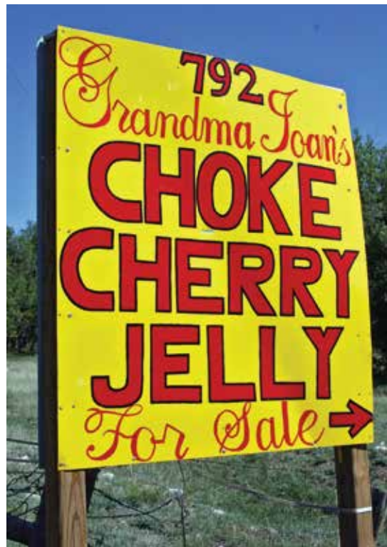
SIGN ON HIGHWAY NEAR CLEVELAND, NM.

The Mora Arts & Cultural Compound in its location, facilities and density is a microcosm of creative and place-based economic development and reflects the traditions and aspirations of the legendary valley.