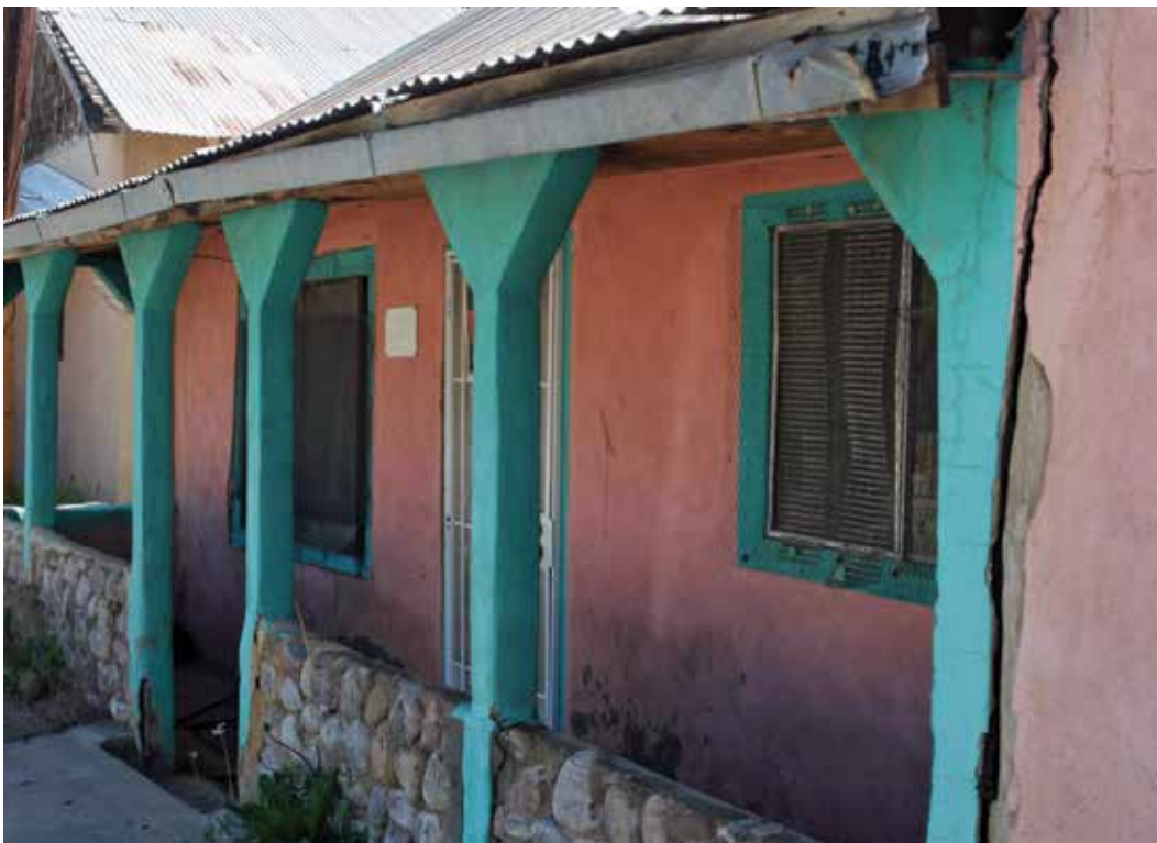
HISTORIC HOUSE NEAR ST. GERTRUDE'S CHURCH, MORA, NM.