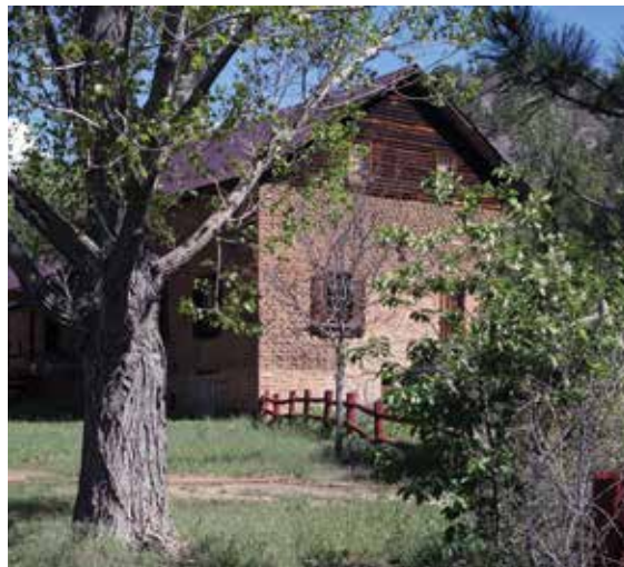
CLEVELAND ROLLER MILL AND MUSEUM, CLEVELAND, NM.

Management Business and financial operations Legal Health care practitioners and technical High-end sales and sales management