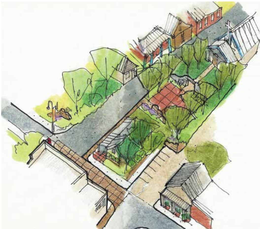
ILLUSTRATION BY LISA FLYNN, MILAGRO DESIGN.