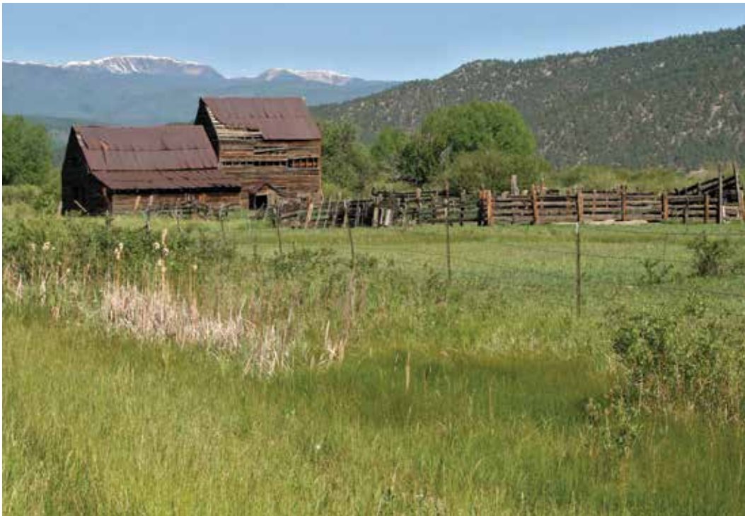
HISTORIC SANCHEZ MILL, MORA VALLEY.