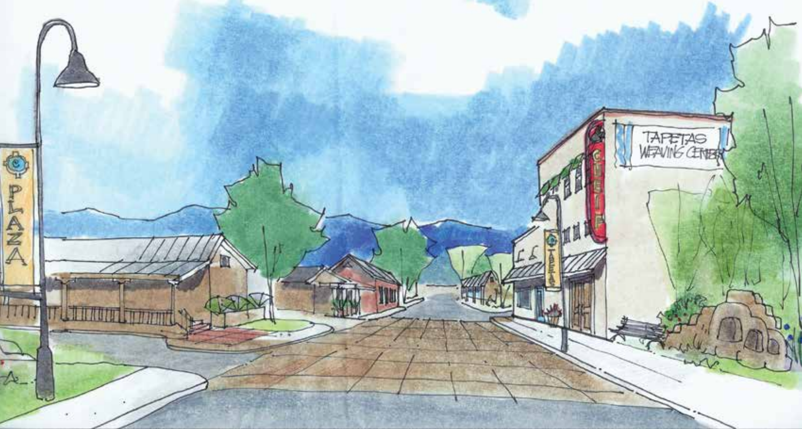
ILLUSTRATION BY LISA FLYNN, MILAGRO DESIGN.